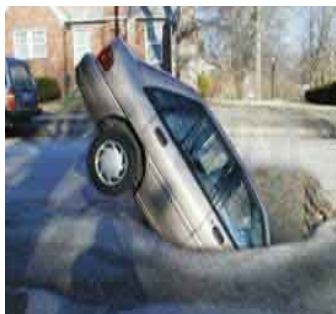
A motorist stopped recently on Walnut Street to examine a pothole.

During severe winter weather, potholes can be created in even the best of streets. The City of Springfield, Office of Public Works wants to stay on top of repairing these bone-jarring craters. You may call (217)789-2255, or visit the city's online "Report a Pothole" page at http://www.springfield.il.us/CITY_GOV/WORKS/Report.htm .